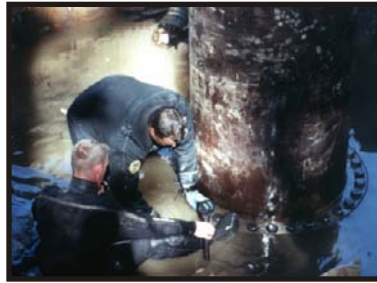
ABOVE: DIVERS INSTALLING MANHOLE ACCESS RISER (right in green) AS FINAL STAGE TO JOINT REPAIR AND PIPE ACCESS POINT