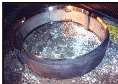
ABOVE: CUSTOM FABRICATED INTERNAL PIPE REPAIR BAND

RIGHT: ROV RECOVERED AFTER DEPLOYMENT INTO THE OUTFALL SYSTEM (1750 ft. Penetration) TO PERFORM DIGITAL VIDEO AND DUAL IMAGING SONAR SURVEYS OF SEDIMENT PROFILE IN THE PIPE AND THE STRUCTURAL CONDITION OF EACH PIPE JOINT. (Accuracy +/- 1/8 inch)