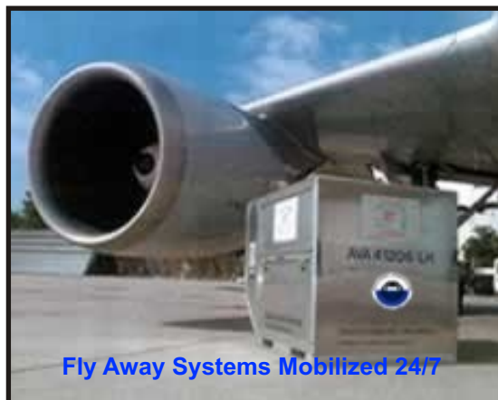
Fly Away Systems Mobilized 24/7